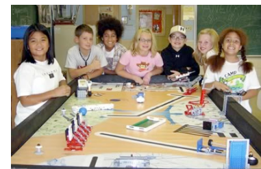
St. Bridgets' great team!