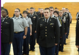
Cadets from around the Midwest area perform knockout