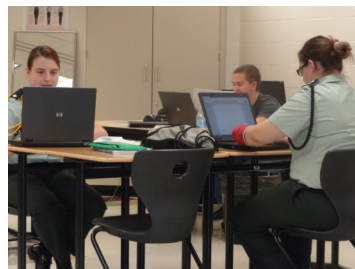
Left: Senior cadets working diligently on their management papers.